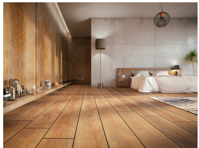
Borchì® OXY-Coat 1310