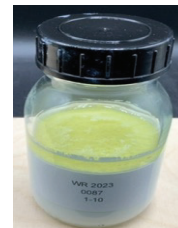
without 7% AOC E

(secondary drier that can also act as a thickener)